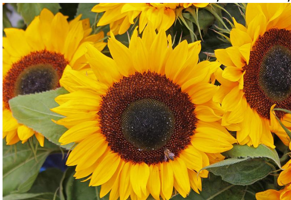
Sunflowers